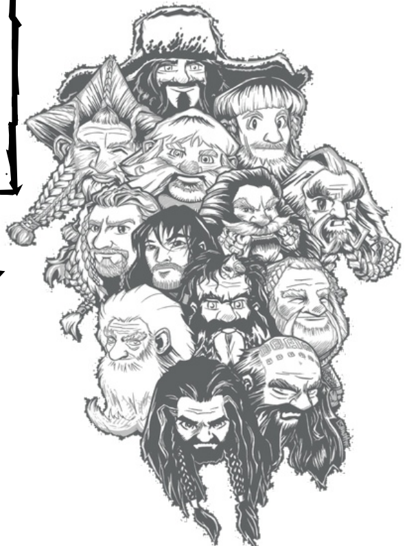
Image found at shirtpunch.com but I didn't manage to get the artist's name and can't find it now. It was not me. For sure. Like really. Not me.

If you don't know who these fellows are, it is truly a shame. If you don't know, ask around, surely someone will know.